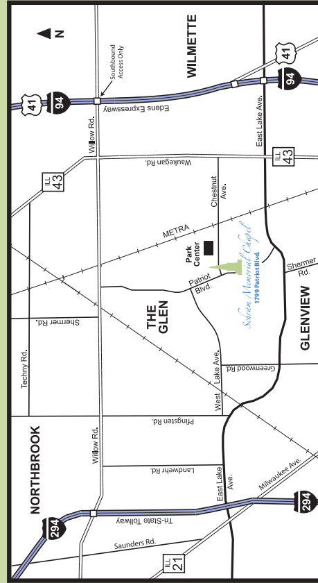
Schram Memorial Chapel is a facility of the Glenview Park District.

Sparkling stained glass windows, brightly polished hardwood floors and pew-style seating for 150 provide the perfect backdrop for memorable pictures. Meticulously landscaped grounds add seasonal beauty to your outdoor photographs.